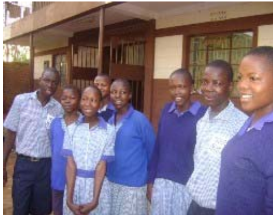
The children who hope to join secondary school next year.

Our long term project is to put up a school that all the children will go to. This will help us reduce costs and if anything make it one of our IGA because the public will need to pay as they enroll. In public schools, children do not get quality education as its 60 children to one teacher. This is very unrealistic because the teachers only concentrate on the ones on front desks as the rest play behind. Its for the same reason that we need to give extra coaching to our candidates as the schools' general performance is low accrued to the overwhelming number s of children in the classrooms which one teacher cannot deal with. We are looking for donors to partner with two others who have already committed to this project.