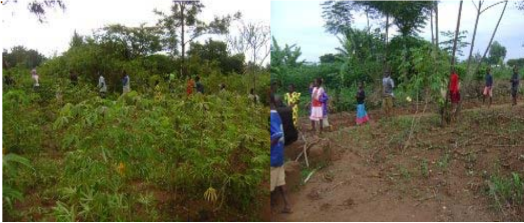
Setting out with the orphans to visit other orphans in their homesteads during Easter

Walking through paths in a bid to visit villages where orphans come from.