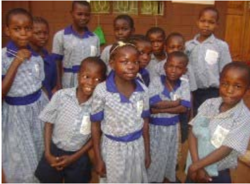
New admissions in the home and the school

which is basically a kindergarten within the compound. Of course January is usually tedious as getting more than 60 children ready for school on the same day is not something you can do normally.