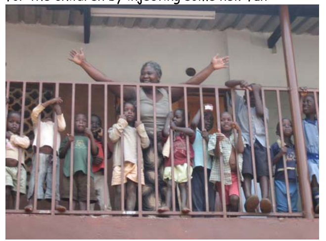
The balconies of the upper floor of the dormitory