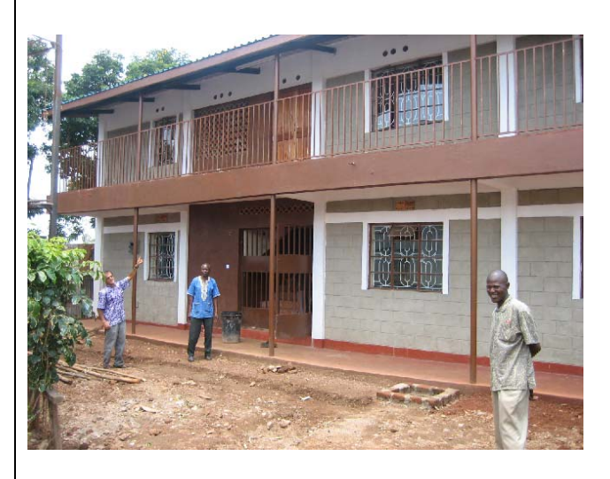
The new dormitory nearing completion in September 2007

from the general public will be attending the school as well.